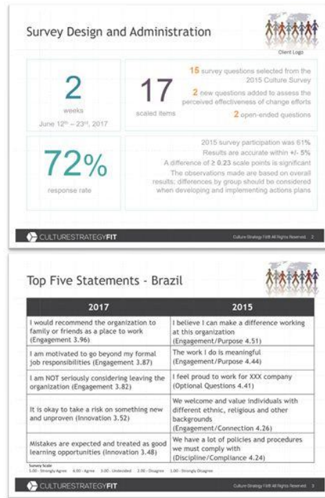
Sample Culture Pulse Report Images

In the sample at right, 15 statements were repeated from the 2015 culture survey and 2 new statements were used to test a culture priority area.